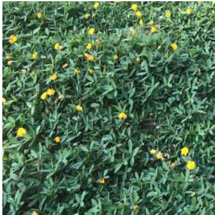
Perennial Peanut ( Arachis glabrata ) Height: Spread: