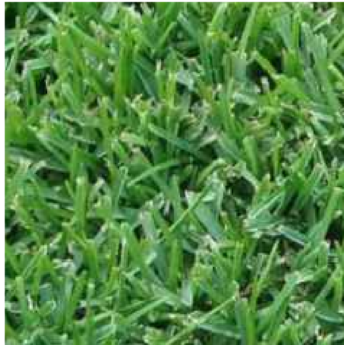
St. Augustine grass ( Stenotaphrum secundatum ) Height: 0.5-2 in