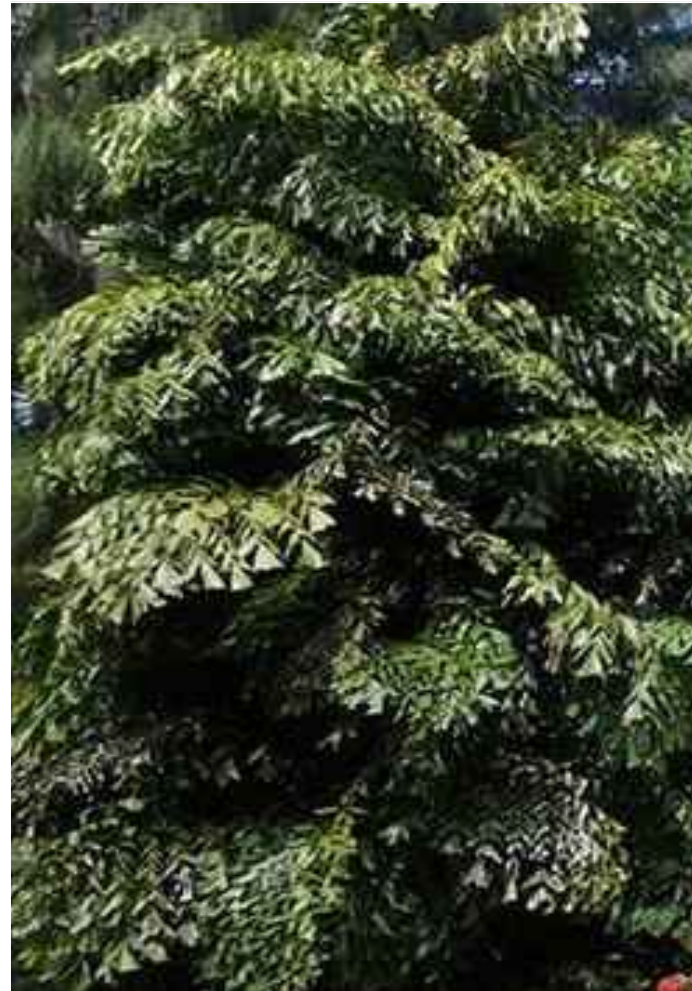
Fishtail Palm ( Caryota mitis ) Height: 15-25 ft Spread: 8-12 ft