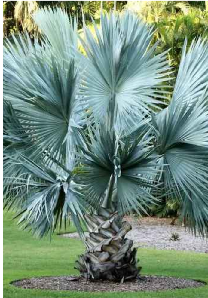
Dwarf Palmetto ( Sabal minor ) Height: 5-10 ft Spread: 3-6 ft