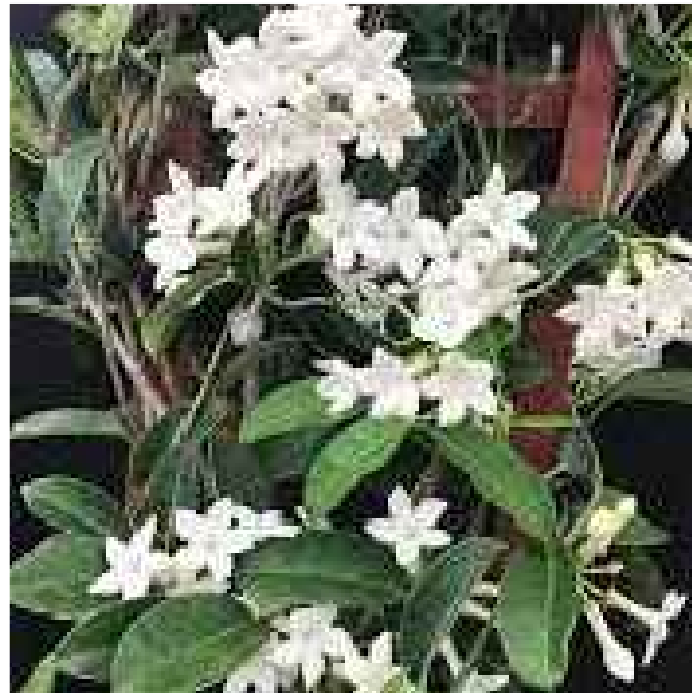
Madagascar Jasmine ( Stephanotis floribunda ) Height: 12-20 ft Spread: 3-6 ft