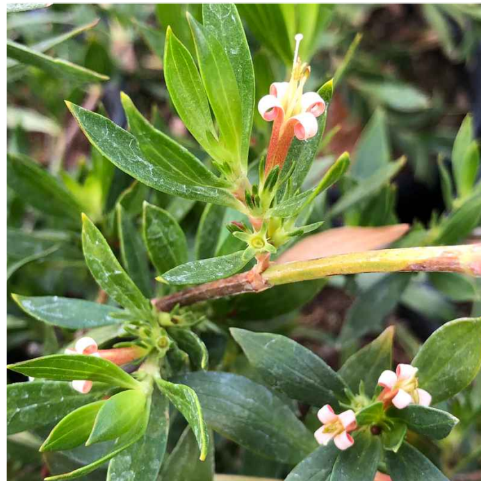
Golden Creeper ( Ernodea littoralis ) Height: 2-3 ft Spread: 3-12 ft