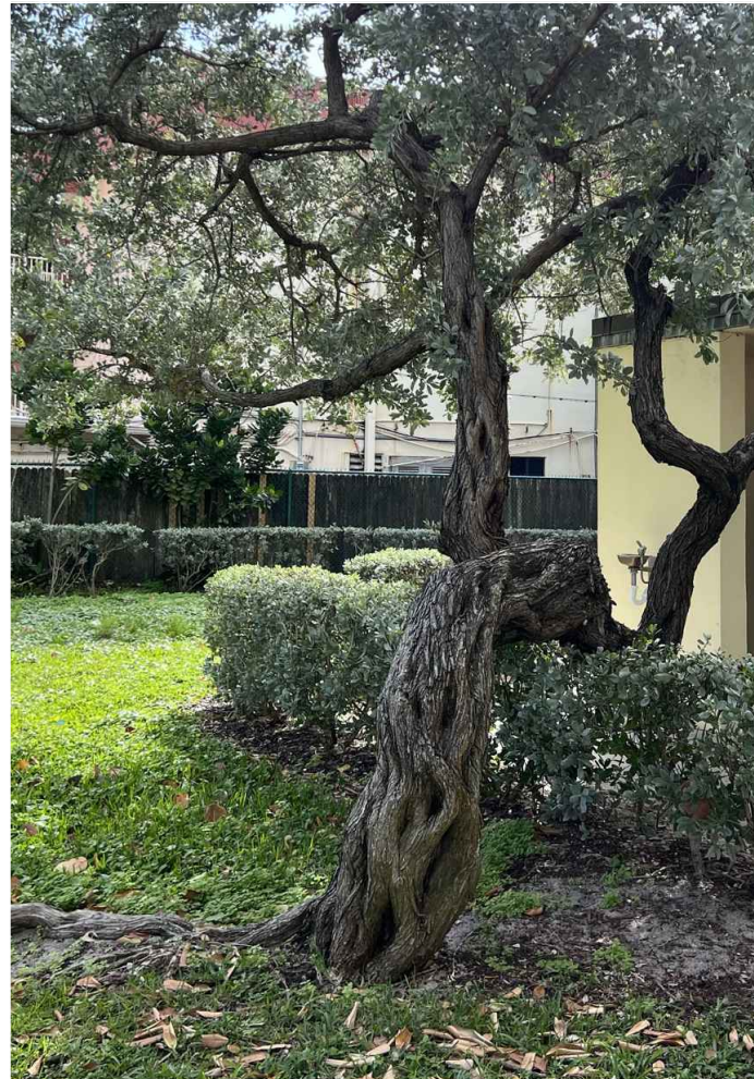
Silver Buttonwood ( Conocarpus erectus sericeous ) Height: 16 ft Spread: 20 ft