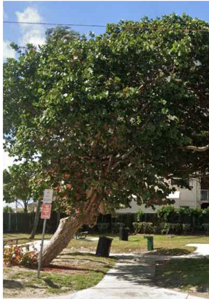
Seagrape ( Coccoloba uvifera ) Height: 25 ft Spread: 30 ft