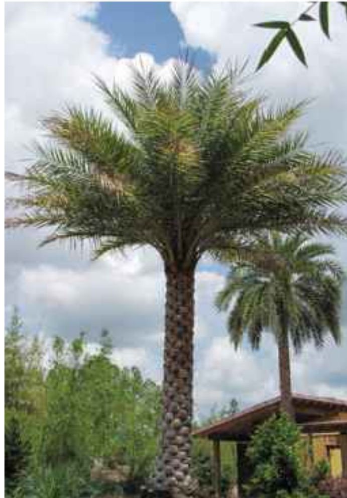
Silver Date Palm ( Phoenix sylvestris ) Height: 30-50 ft Spread: 15-25 ft