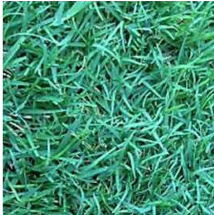
Buffalo grass ( Buchloe dactyloides ) Height: