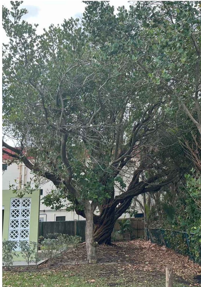
Madagascar Olive ( Noronhia emarginata ) Height: 25 ft Spread: 20 ft