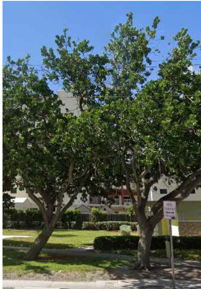
2x Madagascar Olive ( Noronhia emarginata ) Height: 25 ft Spread: 30-35 ft