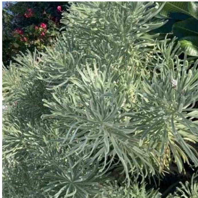
Sea Lavender ( Argusia gnaphalodes ) Height: 4-6 ft Spread: 10-15 ft