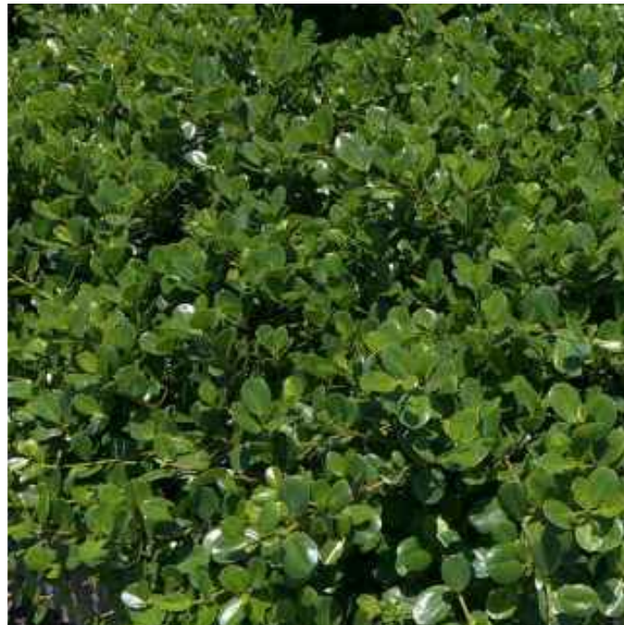
Green Island Ficus ( Ficus microcarpa 'green island') Height: 12-18in Spread: 12-24in