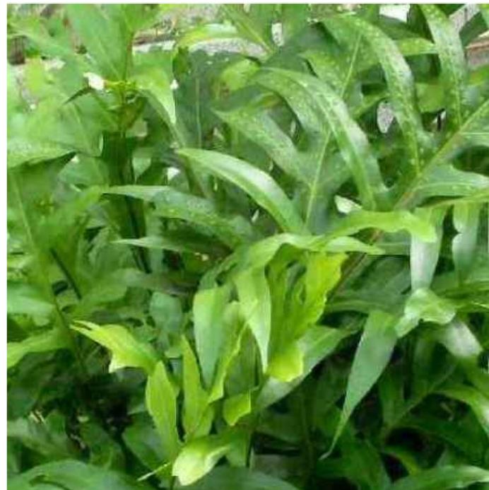
Kangaroo Fern ( Microsorium diversifolium ) Height: 6-12 in Spread: 2-3 ft