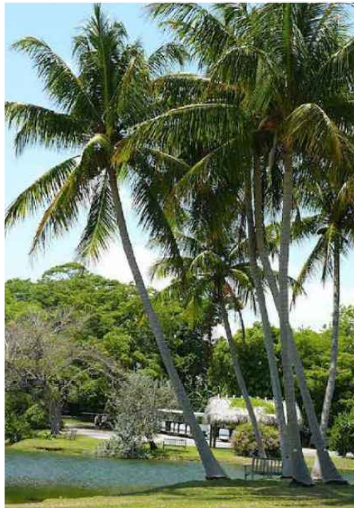
Coconut Palm ( cocos nucifera ) Height: 30-50 ft Spread: 15-20 ft