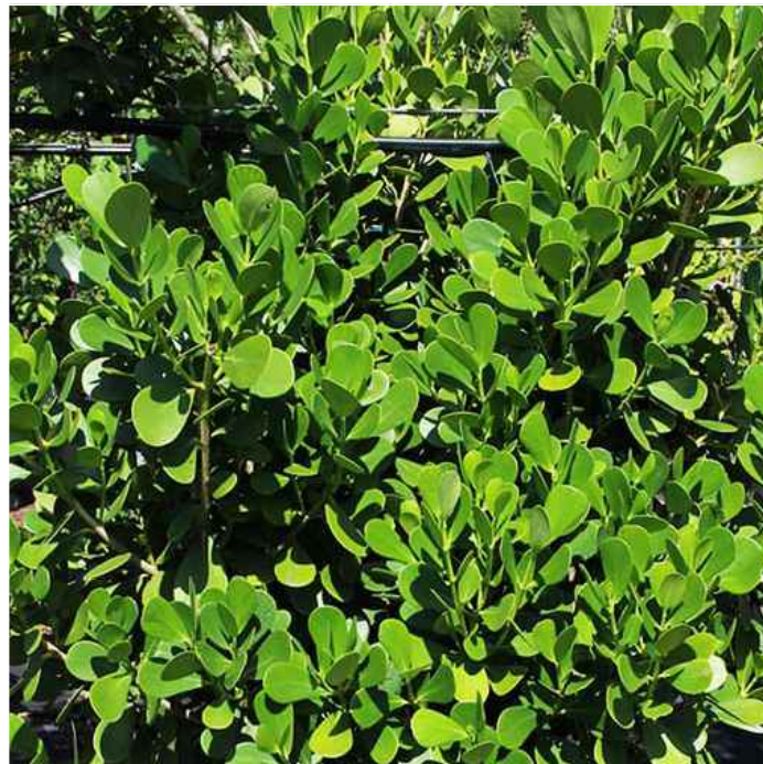
Small Leaf Clusia ( Clusia guttifera ) Height: 4-6 ft Spread: 3-6 ft