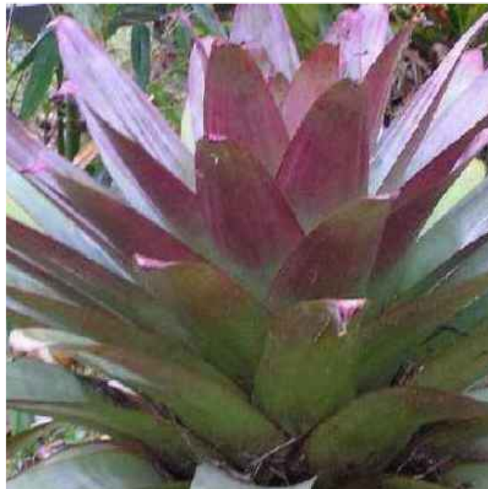
Giant Bromeliad ( Alcantarea imperialis ) Height: 2-3 ft Spread: 1-2 ft